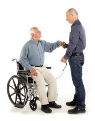
With the SitnStand