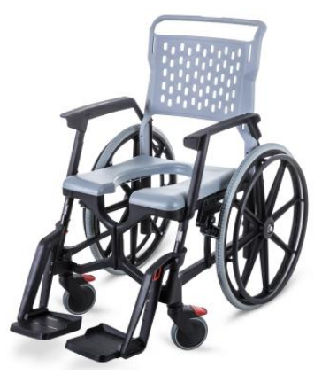
Self propeling wheels 24"