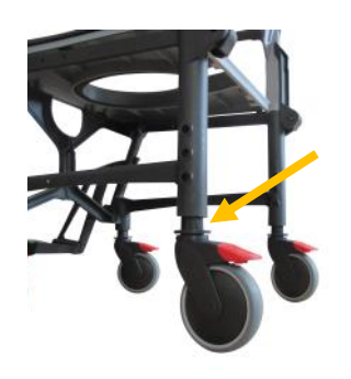
Position 3 (+ 4 cm)